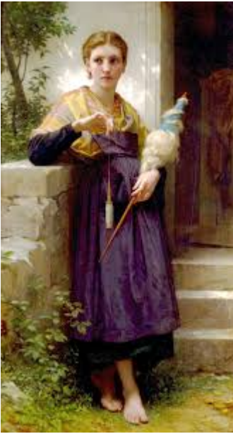
Woman with distaff: Whence it came, hence the name.

I'm tempted to yell “mixed metaphor,” but it's the playoffs, and I know I'm not going to get the call. No ref wants to blow a freestyle poetry battle in front of a big crowd and I have to say, even though it's against my interests, that I agree—let ‘em play.